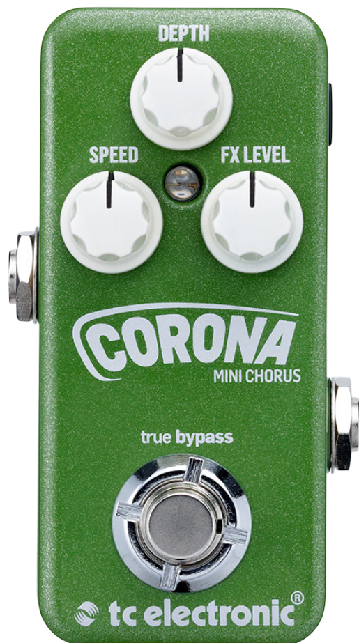
Corona Mini Chorus